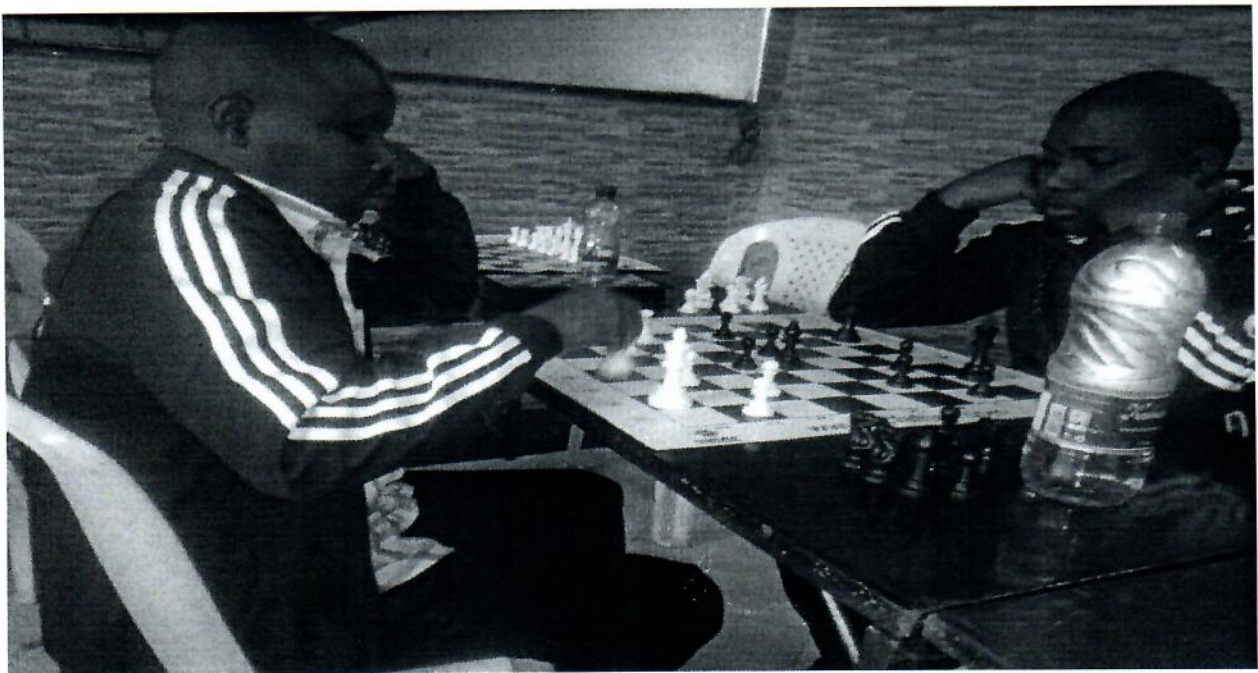
Assembly's Chess Team.