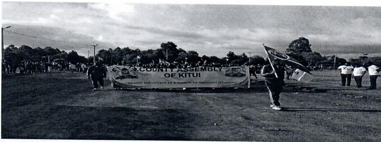
The County Assembly of Kitui marching during the Opening Ceremony.