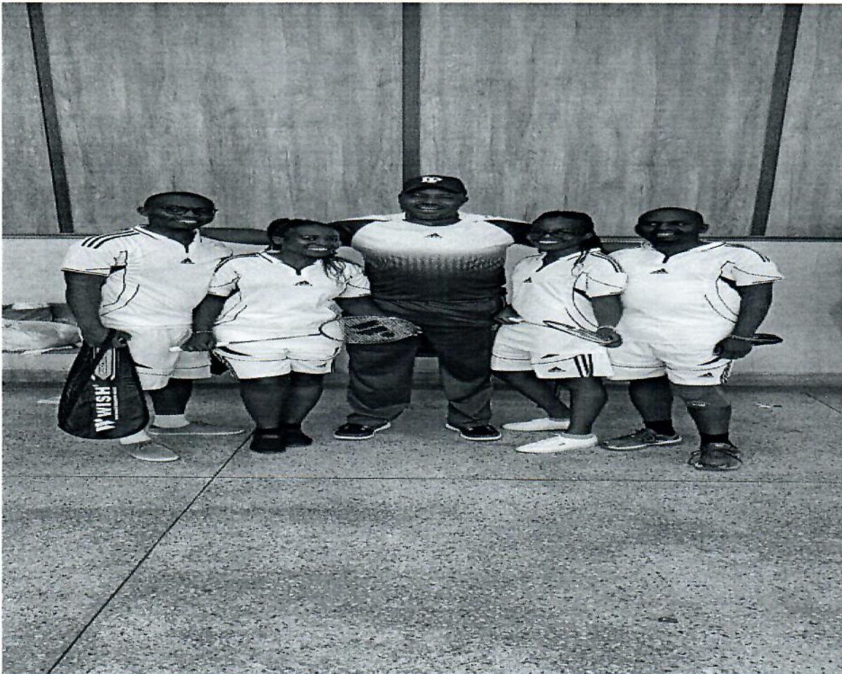
The Honourable Majority Leader and Captain of the Assembly's Badminton Team.