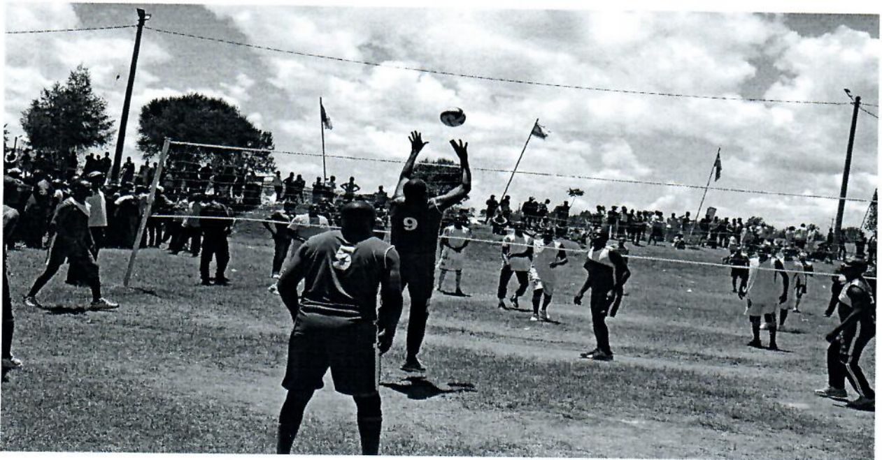
Assembly's Men Volleyball Team playing against Baringo.