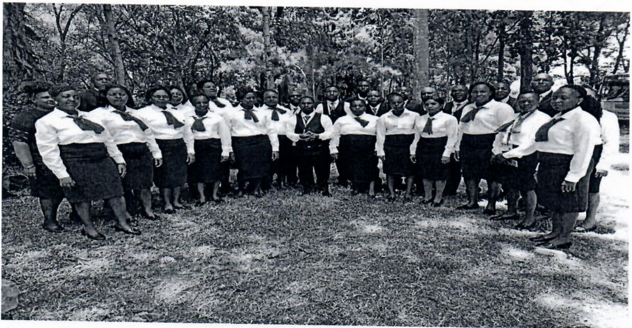
The Assembly's Choir.