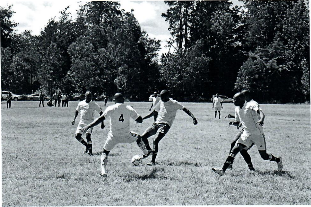
Assembly's Football team playing against Nairobi County Assembly