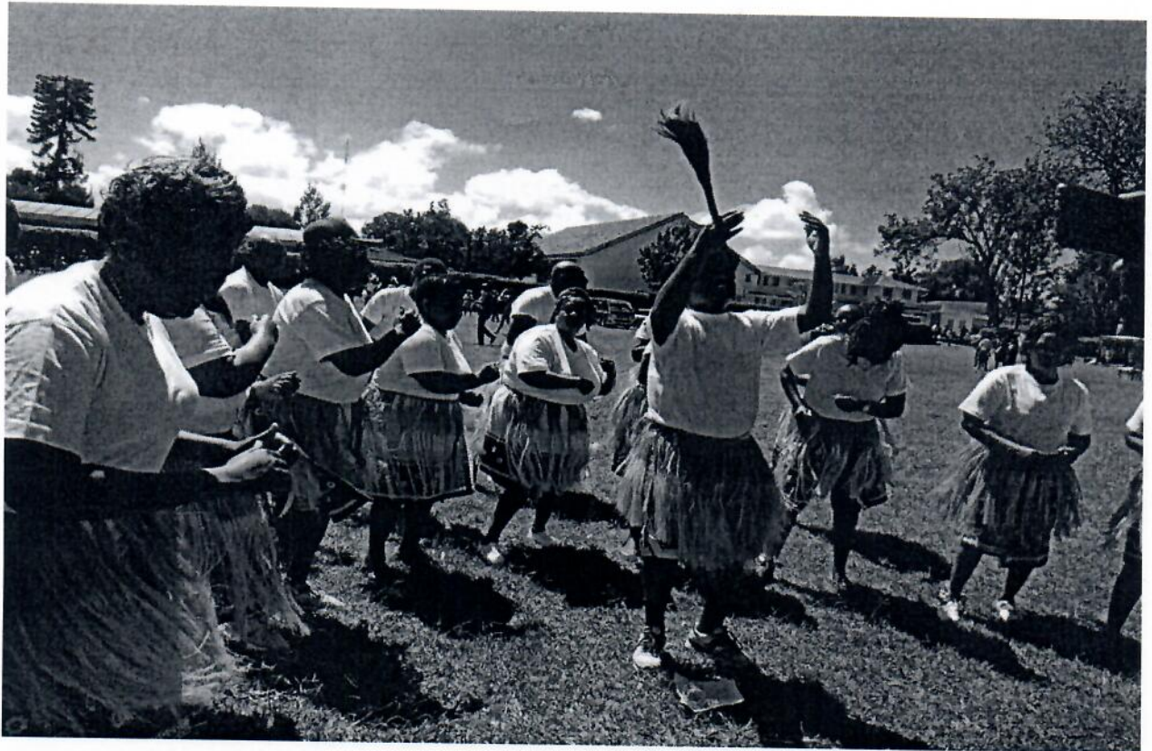
Assembly's Cultural Dance Team