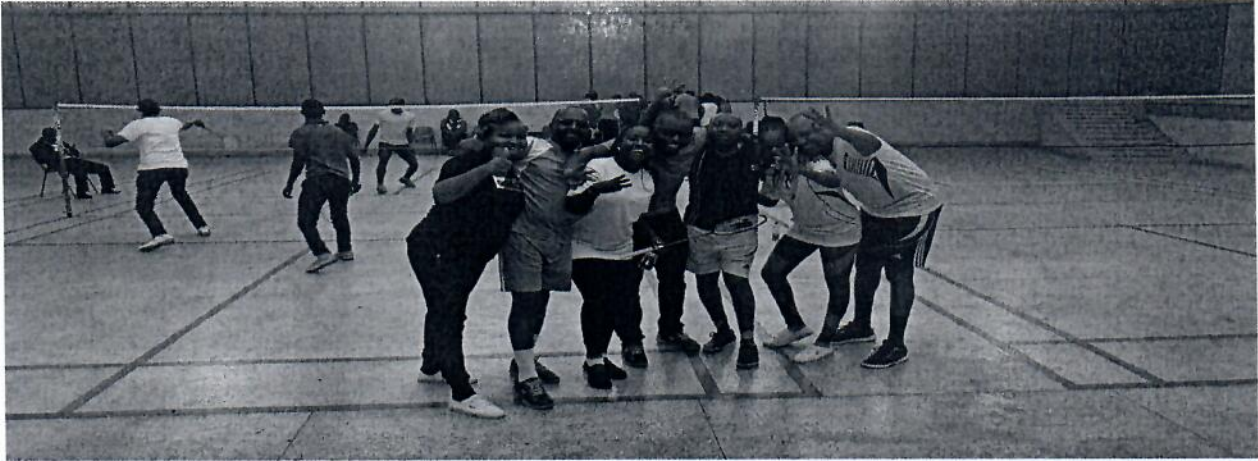
The Assembly's Badminton Team.