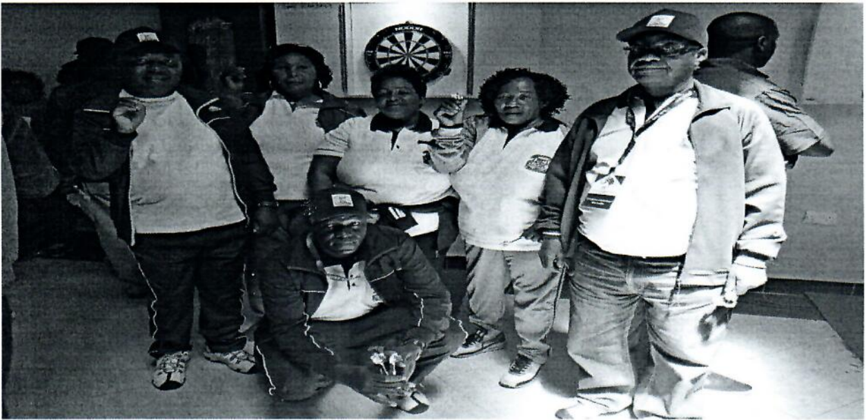
The Honourable Speaker and Captain of the Assembly's darts team.