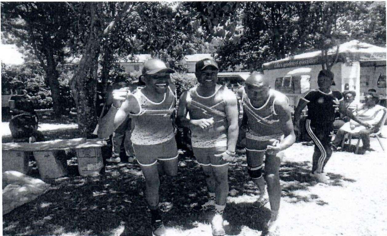
The Assembly's Athletics Team.